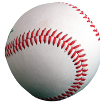
Baseball = 2 ¾ inches