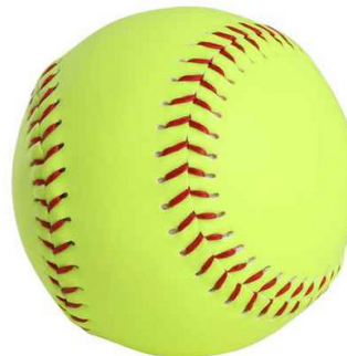
Softball = 4 ½ inches