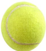
Tennis Ball = 2 ½ inches