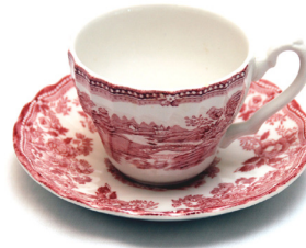
Tea Cup = 3 inches