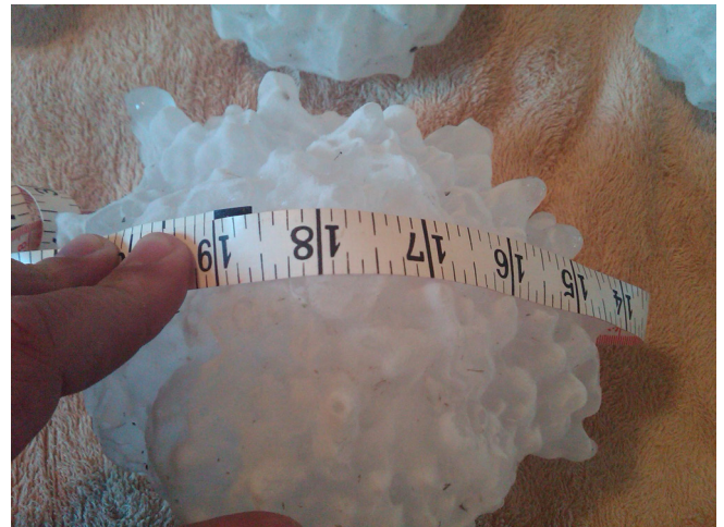
The largest hailstone recorded in the U.S. at 8 inches in diameter and 18.62 inches in circumference.