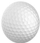
Golf Ball = 1 ¾ inches