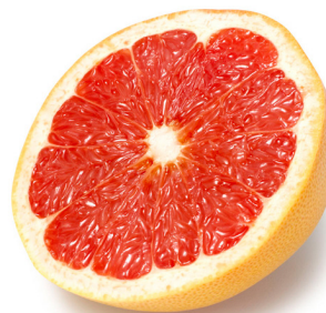
Grapefruit = 4 inches